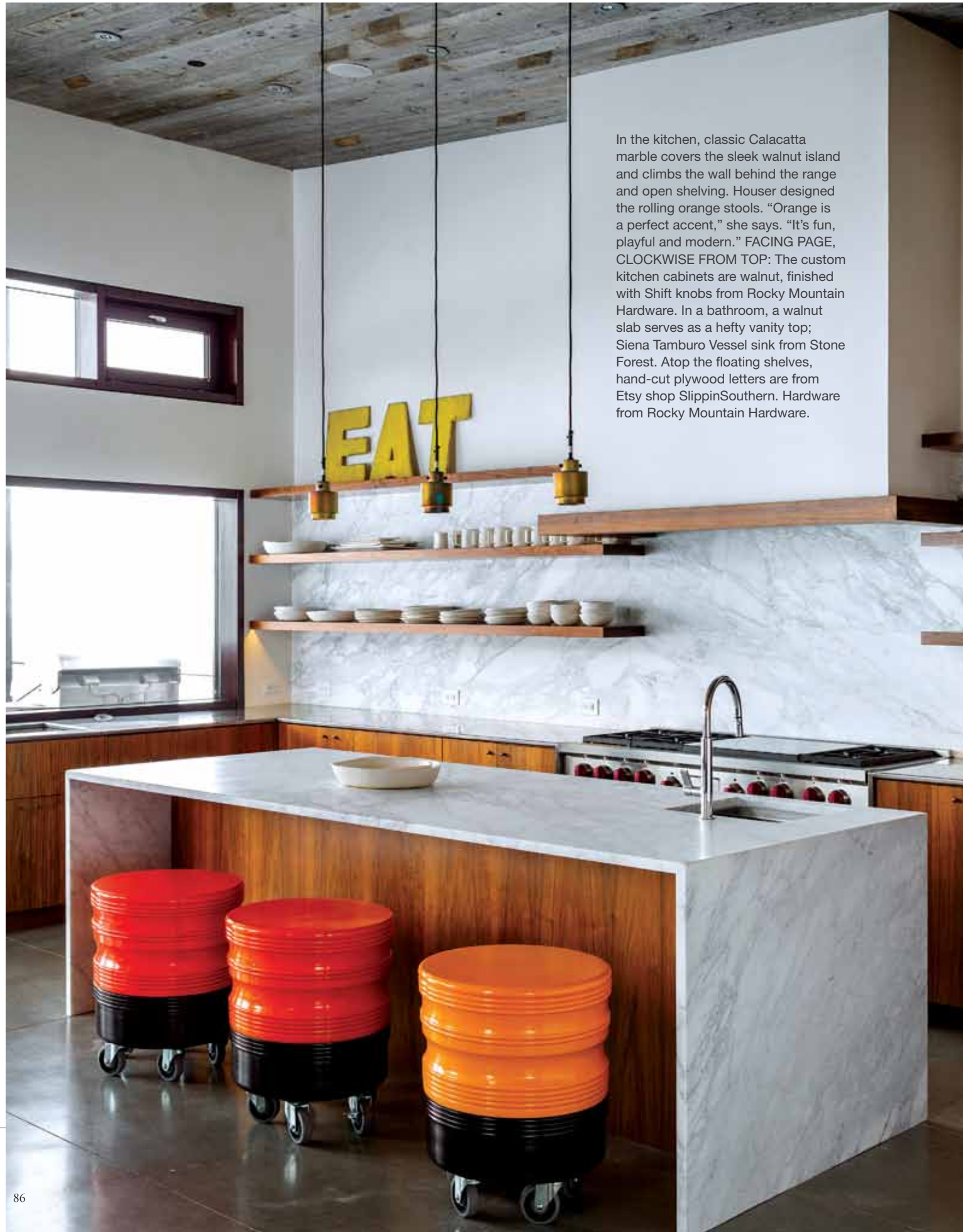
In the kitchen, classic Calacatta marble covers the sleek walnut island and climbs the wall behind the range and open shelving. Houser designed the rolling orange stools. "Orange is a perfect accent," she says. "It's fun, playful and modern." FACING PAGE, CLOCKWISE FROM TOP: The custom kitchen cabinets are walnut, finished with Shift knobs from Rocky Mountain Hardware. In a bathroom, a walnut slab serves as a hefty vanity top; Siena Tumburo Vessel sink from Stone Forest. Atop the floating shelves, hand-cut plywood letters are from Etsy shop SlippinSouthern. Hardware from Rocky Mountain Hardware.