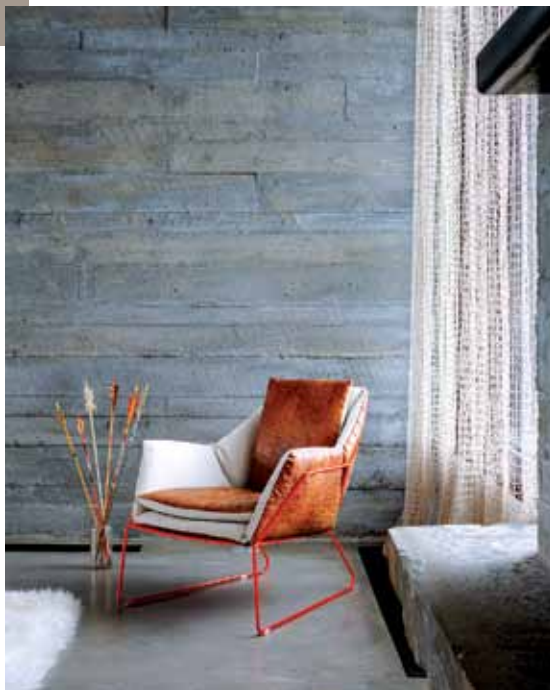
CLOCKWISE FROM TOP: In the living room, Random Lights from Moooi hang over a custom coffee table, designed by Houser and built by Integrity Builders in Bozeman. The New York Chair by Alchemy Collections adds a splash of color in the corner of the living room. Expanses of glass let in natural light and add to the home's contemporary style. FACING PAGE: "I think of the home's materials not as decorative, but as an extension of the landscape," says Pearson.

"THE WINGED ROOF FLOATS AND THE REST OF THE HOME FEELS GROUNDED. IT'S ANCHORED AND LIGHT. NOT ONE OR THE OTHER, BUT BOTH."